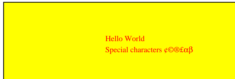
Figure 11-1: 'Hello World'

This will produce a PDF file containing the following graphic: